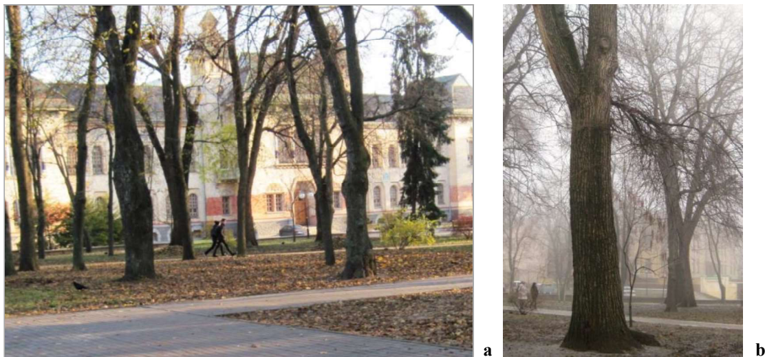
Fig. 2. Petrovsky Park. View to The Poltava Museum of Local Lore named after Vasyl Krichevsky (A), 130 years old tree of Ulmus carpiniifolia Rupr (B)

Petrovsky Park , opened in 1909 to the 200th anniversary of the Poltava Battle occupies an area of 2 ha created in regular style. Species composition has 57 species, forms and hybrids. About 15 species and forms have been observed since the first plantings to the present day, in particular: Aesculus hippocastanum L., Ulmus caprinifolia L., Sorbus intermedia Ehrh., Tilia europaea L. and Tilia heterophylla Vent., Quercus robur L. and Quercus robur f. fastigiata (Lam.) DC., Acer platanoides L. (Халимон, 2009) (Fig. 2.).