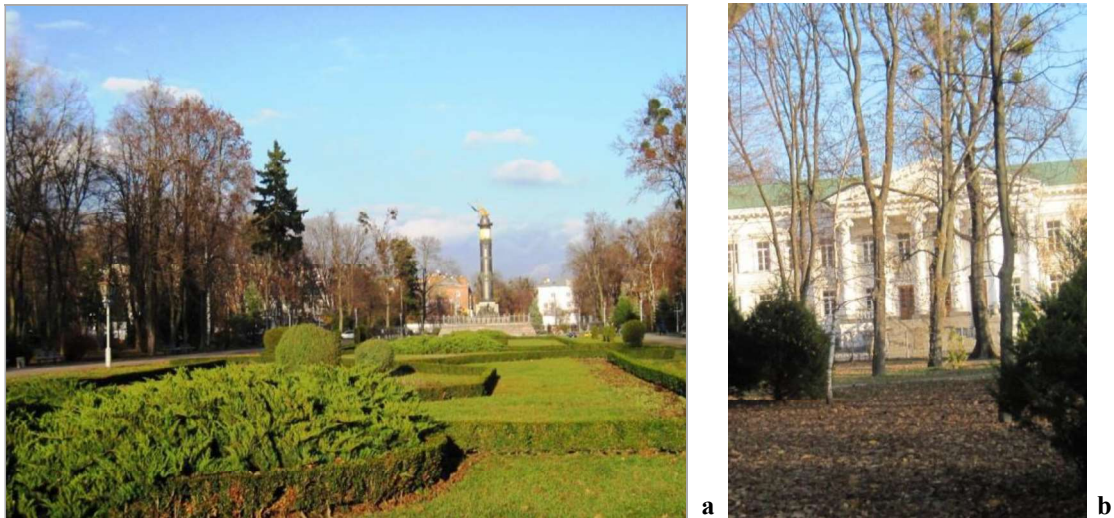
Fig. 1. Parterre part of Korpusny Garden (A), Linden trees in Korpusny Garden (B)

The Linden trees of 130-years old, which have survived since the first plantings were observed in the park in 2017. The non-native species Tilia europaea L. showed a predominantly appearance of native Tilia cordata Mill. In the growth rates (Table 2). The stability and reproduction intensity of both species were at the same level (Fig. 3).